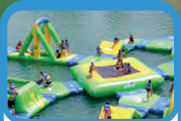
Water play area