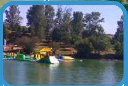
Beach Swimming area